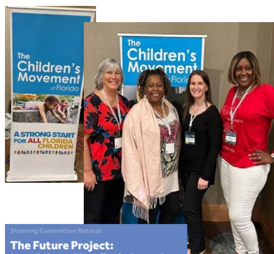
Steering Committee Retreat